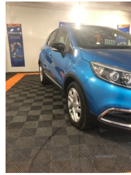
*** AUTOMATIC *** *** AUTOMATIC *** AUTOMATIC ***

** LOW MILEAGE VEHICLE ** ** LOW MILEAGE VEHICLE ** ** LOW MILEAGE VEHICLE **